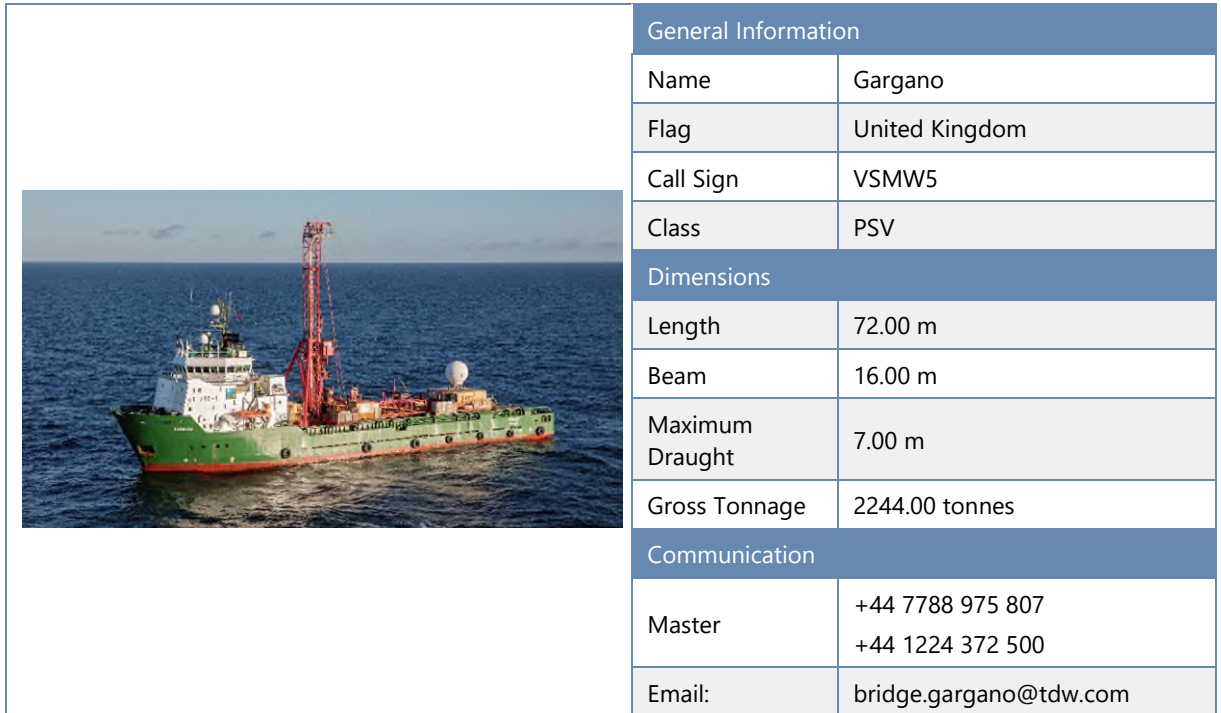
Table 5.1: Gargano

The geotechnical operations will be conducted by the geotechnical drilling vessel Gargano. Client, contractor, and fisheries liaison contact details are provided in the Notice to Mariners distribution list in Section 6.