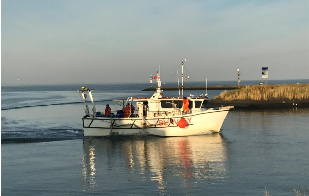
Figure 2: Valkyrie

Contact details for the Valkyrie are as follows: