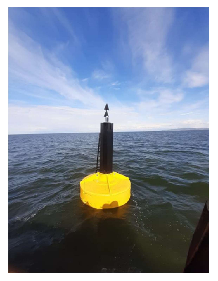
Figure 2 Marker buoy