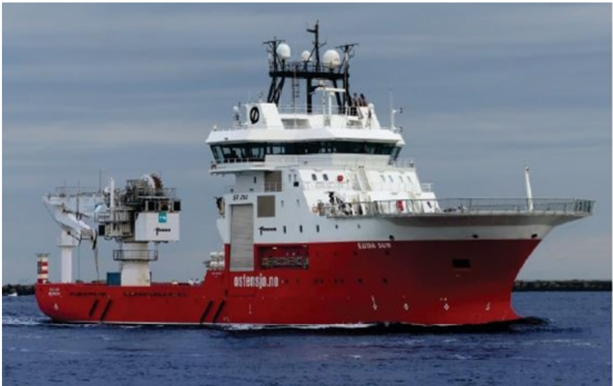
Figure 2: Edda Sun

The Edda Sun (call sign LARF7), an 85.30m dedicated ROV Support Vessel, will be conducting a survey of the subsea cables utilising an ROV. The vessel will be operating on a 24-hour basis. Throughout survey operations, the vessel will follow normal regulations at sea and it will show restricted manoeuvrability signal when in DP mode (lights on mast). The vessel will require other vessels to maintain a wide berth of at least 250m.