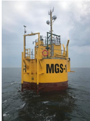
Minesto MGS 1 buoy