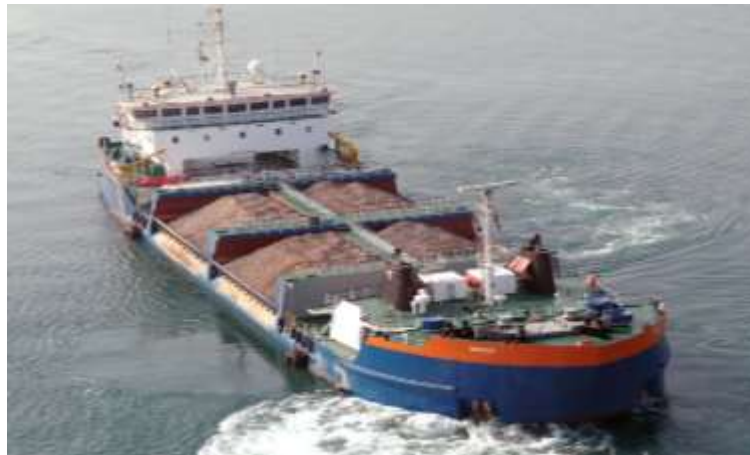
Rock Placement vessel – Ham 602

The vessels will monitor VHF Channel 16 at all times.