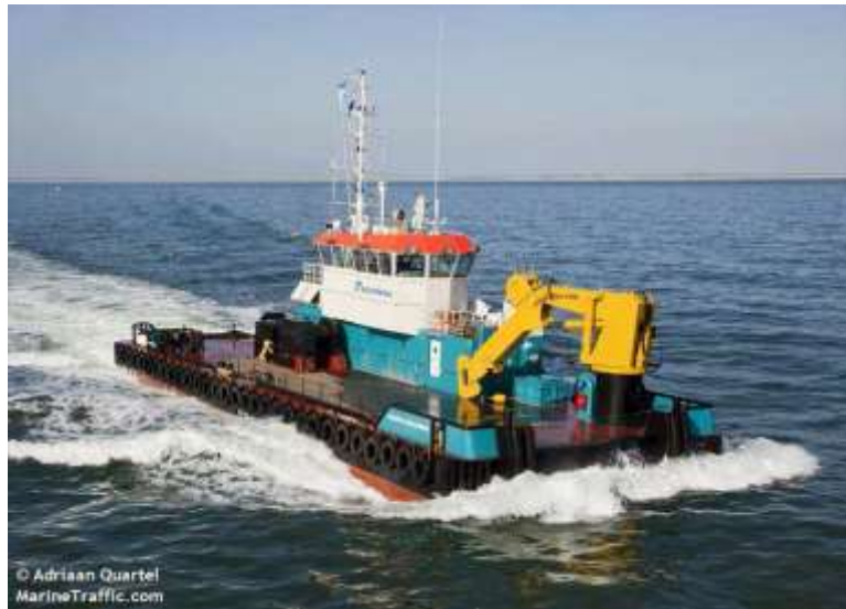
Figure 2 PLIB Support vessel - Jif Challenger