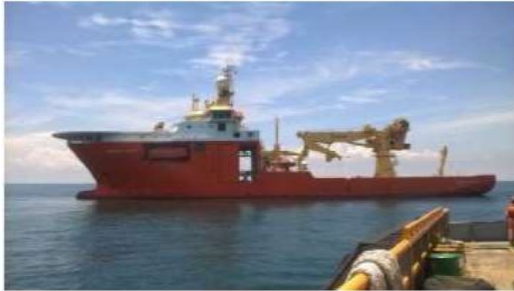
Figure 1 PLIB Support vessel - Normand Pacific