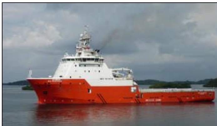
Plough Support vessel - Go Pegasus