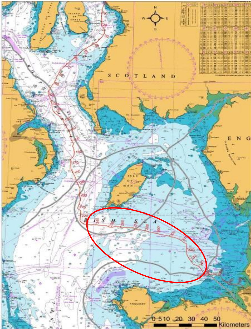
Figure 3 – Western Link cable route and highlighted second Deep Water installation section (in Red)