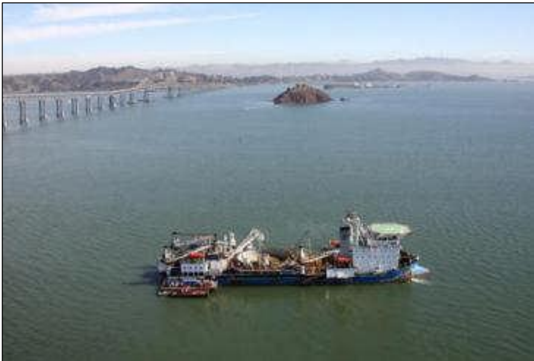
Cable Laying vessel - Giulio Verne

The vessels will monitor VHF Channel 16 at all times.