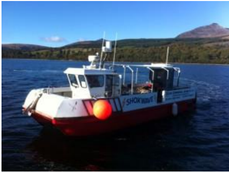
Photograph 1 – SHOCKWAVE