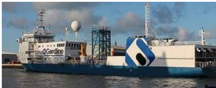
Photograph 3 – SV OCEAN RELIANCE

Offshore: From the 15 metre contour off Ardneil Bay to the 15 metre contour off Port a' Mhiadair, the survey will be conducted by MV OCEAN RELIANCE, see photograph 3, which will be operating a ROV and towing underwater side scanning sonar and a magnetron.