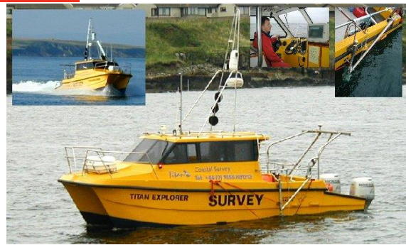
Photograph 2 – TITAN EXPLORER

TITAN EXPLORER will tow an underwater side scanning sonar and a magnetron and Clyde Commercial Divers will conduct a visual survey of the route from the shoreline to the 15 metre contour depth. These operations will take place in daylight hours commencing on Tuesday 10 th March until on and about Friday 3 rd April 2015. Both vessels will be displaying appropriate shapes and flags for their operations and all vessels are to maintain a safe distance and operate at reduced speed with due regard to the effects of wash.