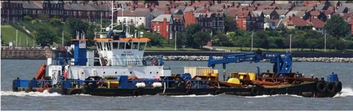
MCS Ailsa [Anchor handling support vessel]