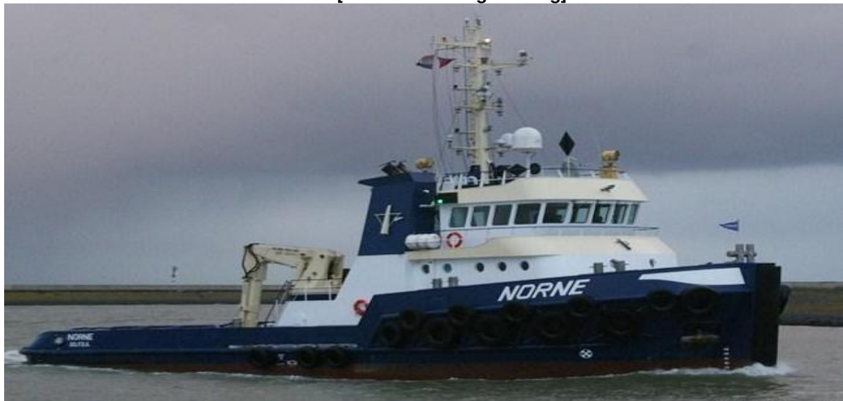
Norne [Anchor Handling lead tug]