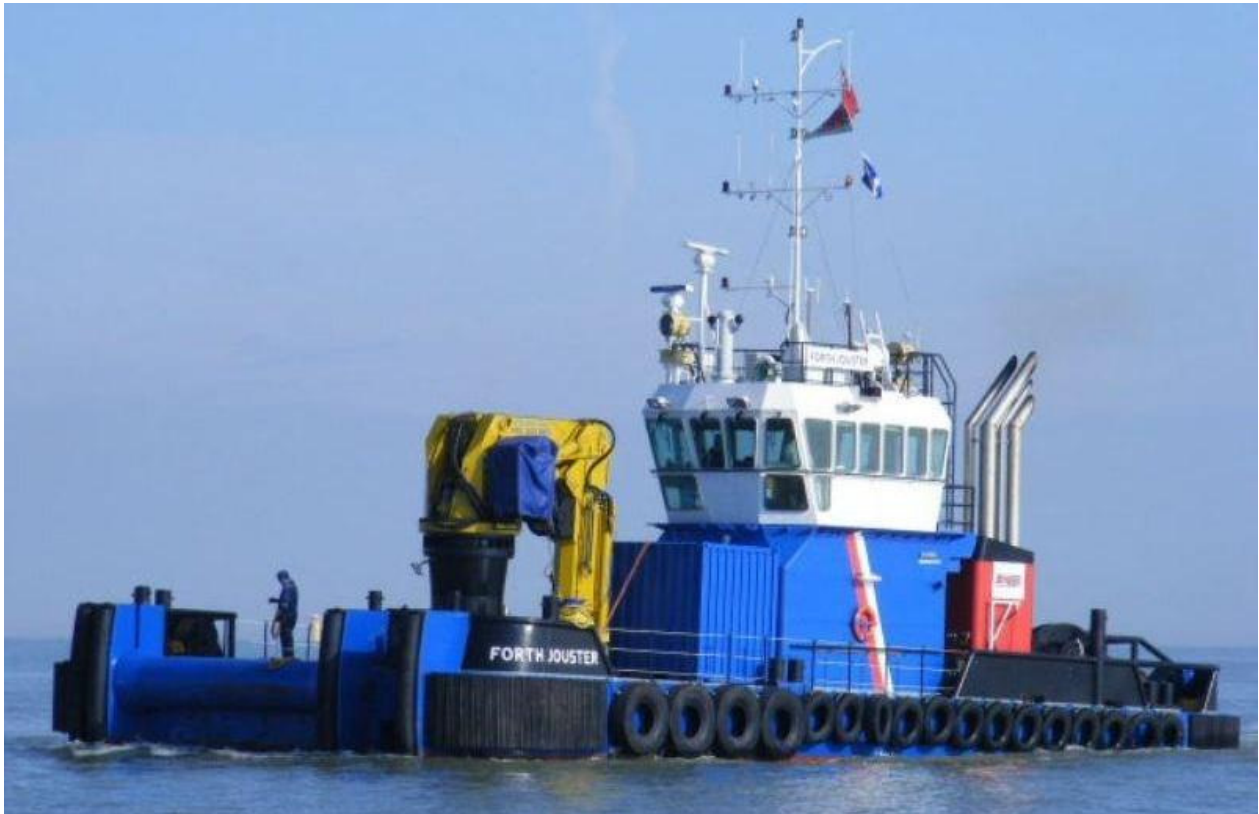
Forth Jouser [Anchor handling support vessel]

Distribution: As per GyM Notices To Mariners Distribution List. Please feel free to share the information.