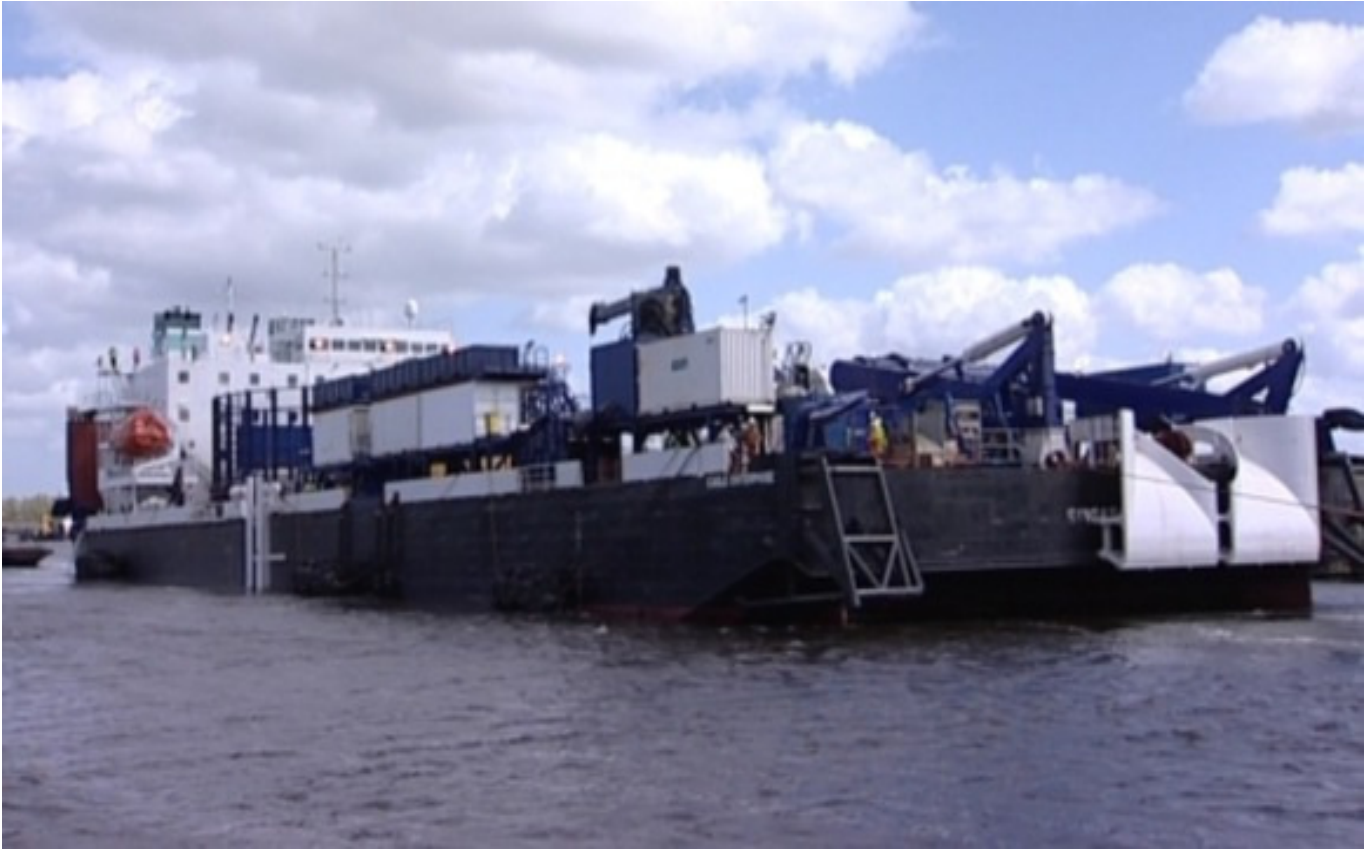
Cable Enterprise [Export Cable laying Vessel] 6 Point mooring system [Anchor cables]