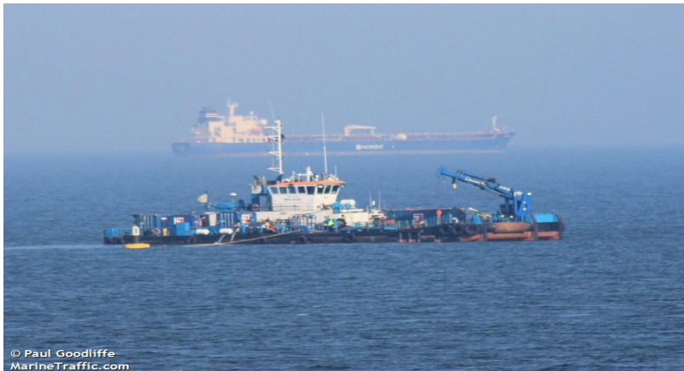
Support Vessel MCS Ailsa

Distribution: As per GyM Notices To Mariners Distribution List. Please feel free to share the information.