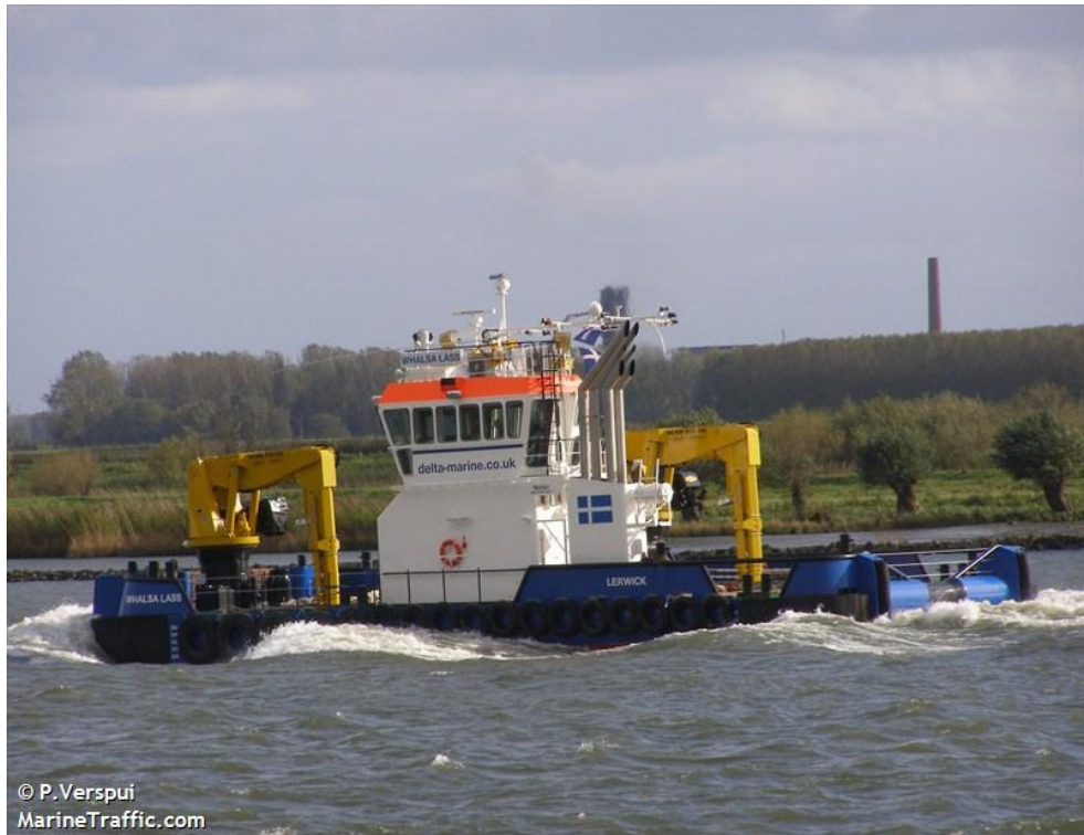
Support Vessel – Whalsa Lass