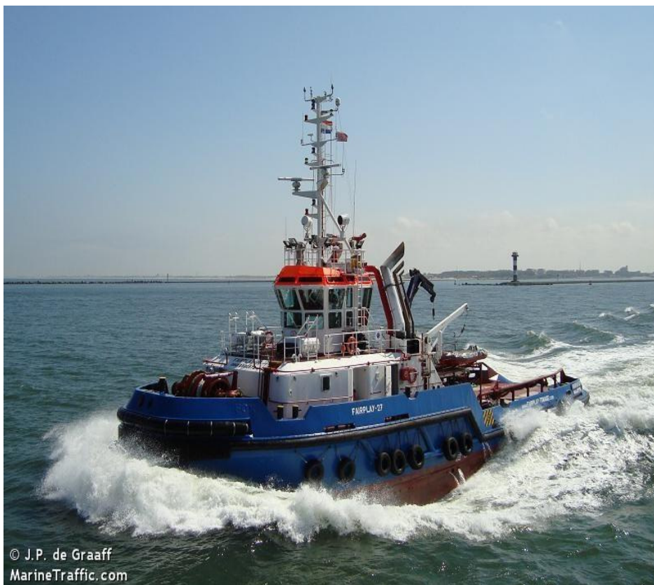
Lead Tug – Fairplay 27