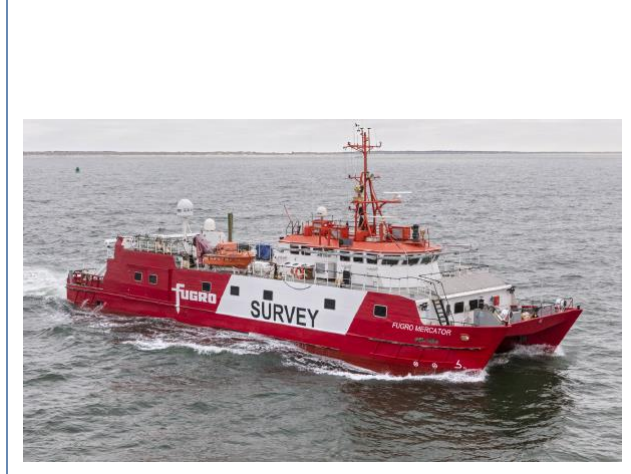
Table 2: Fugro Mercator

Client, contractor and fisheries liaison contact details are provided in the Notice to Mariners distribution list in Section 6.