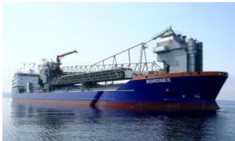
Rock Placement vessel - Nordnes

The vessel will monitor VHF Channel 16 at all times.