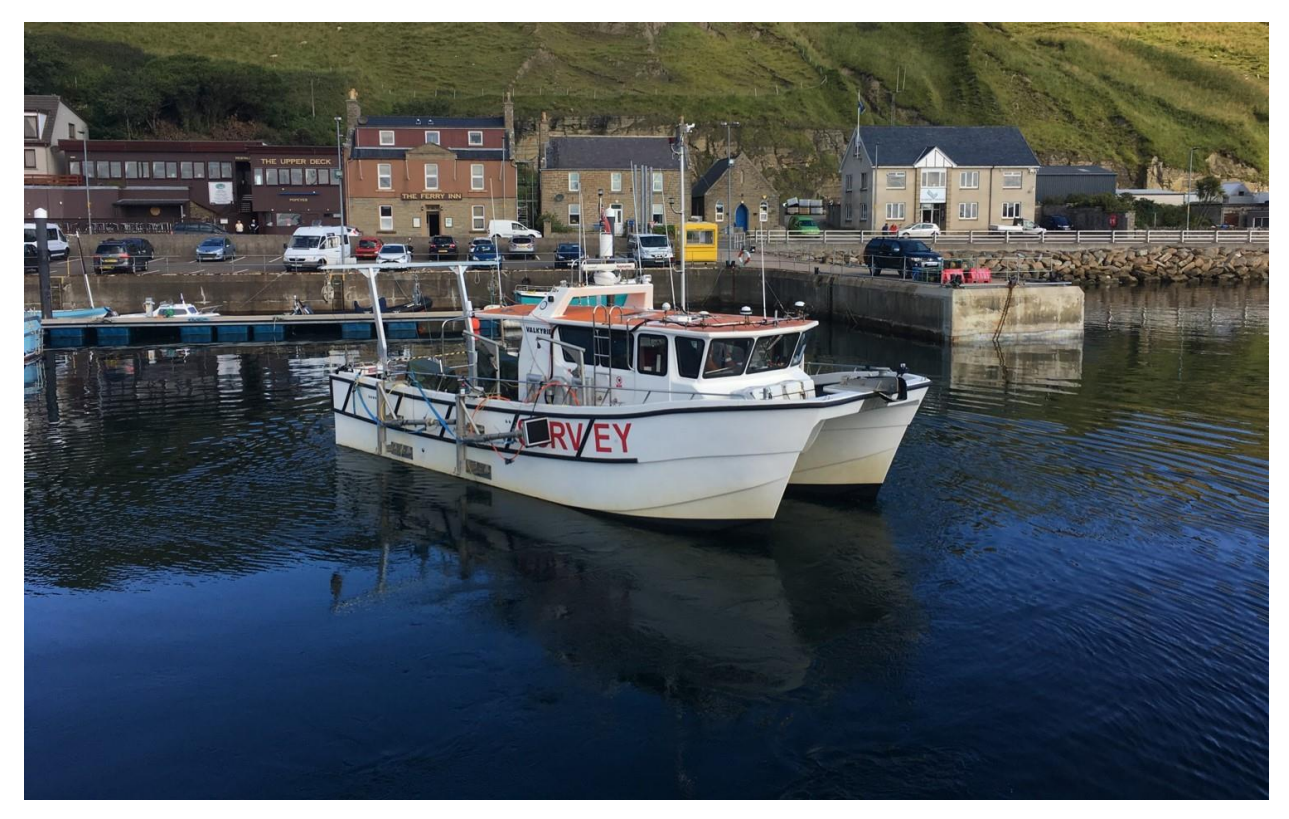
Figure 2: Valkyrie