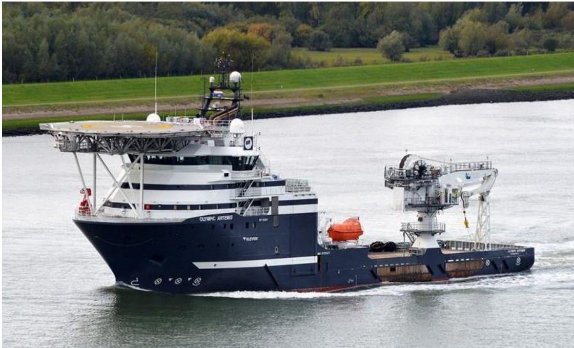
DP2 Vessel “OLYMPIC ARTEMIS”

Vessels are requested to pass at a safe speed and distance and fishing vessels are advised to remain a safe distance (approximately 1.5 nautical miles) from the areas identified in Table 1.