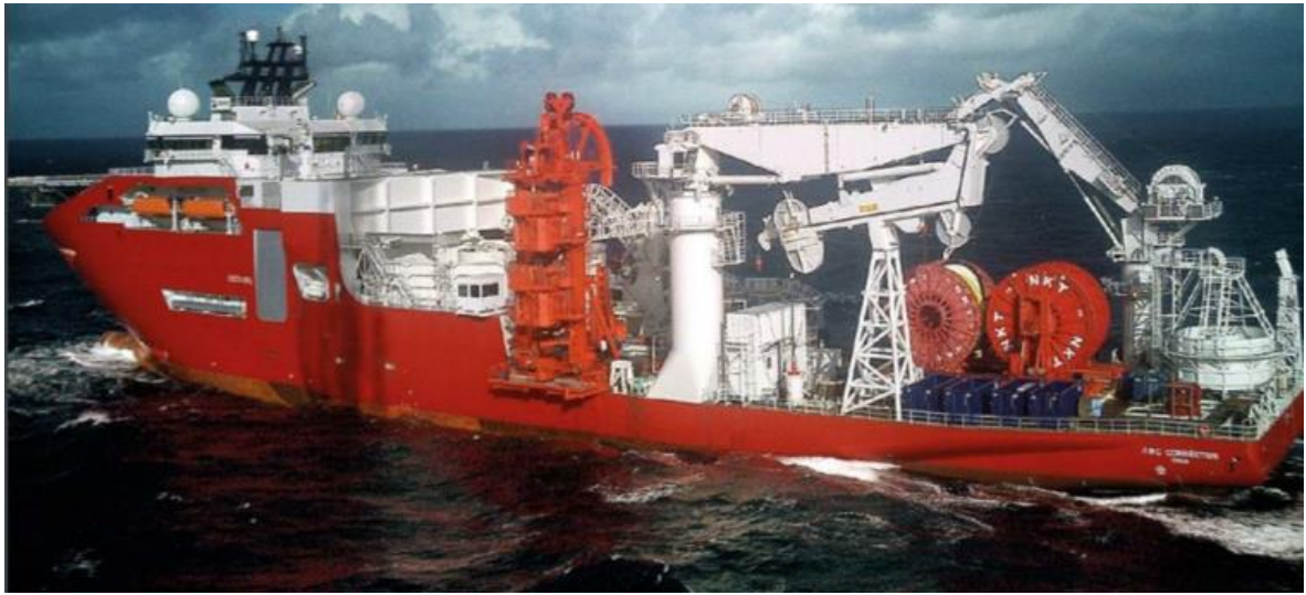
DP3 Vessel "LEWEK CONNECTOR"