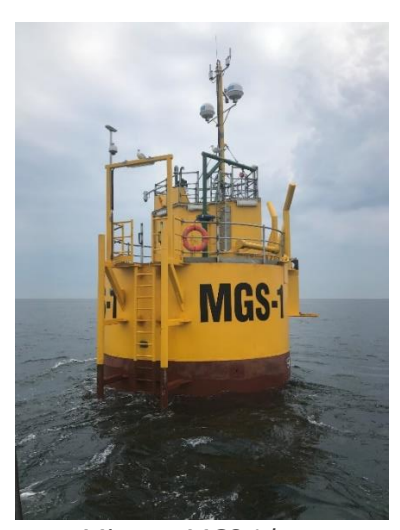
Minesto MGS 1 buoy