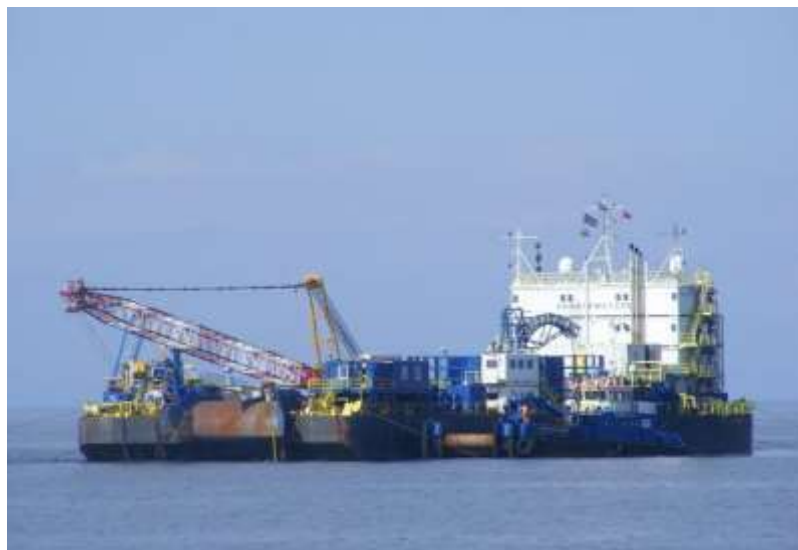
Multipurpose barge "STEMAT 82"