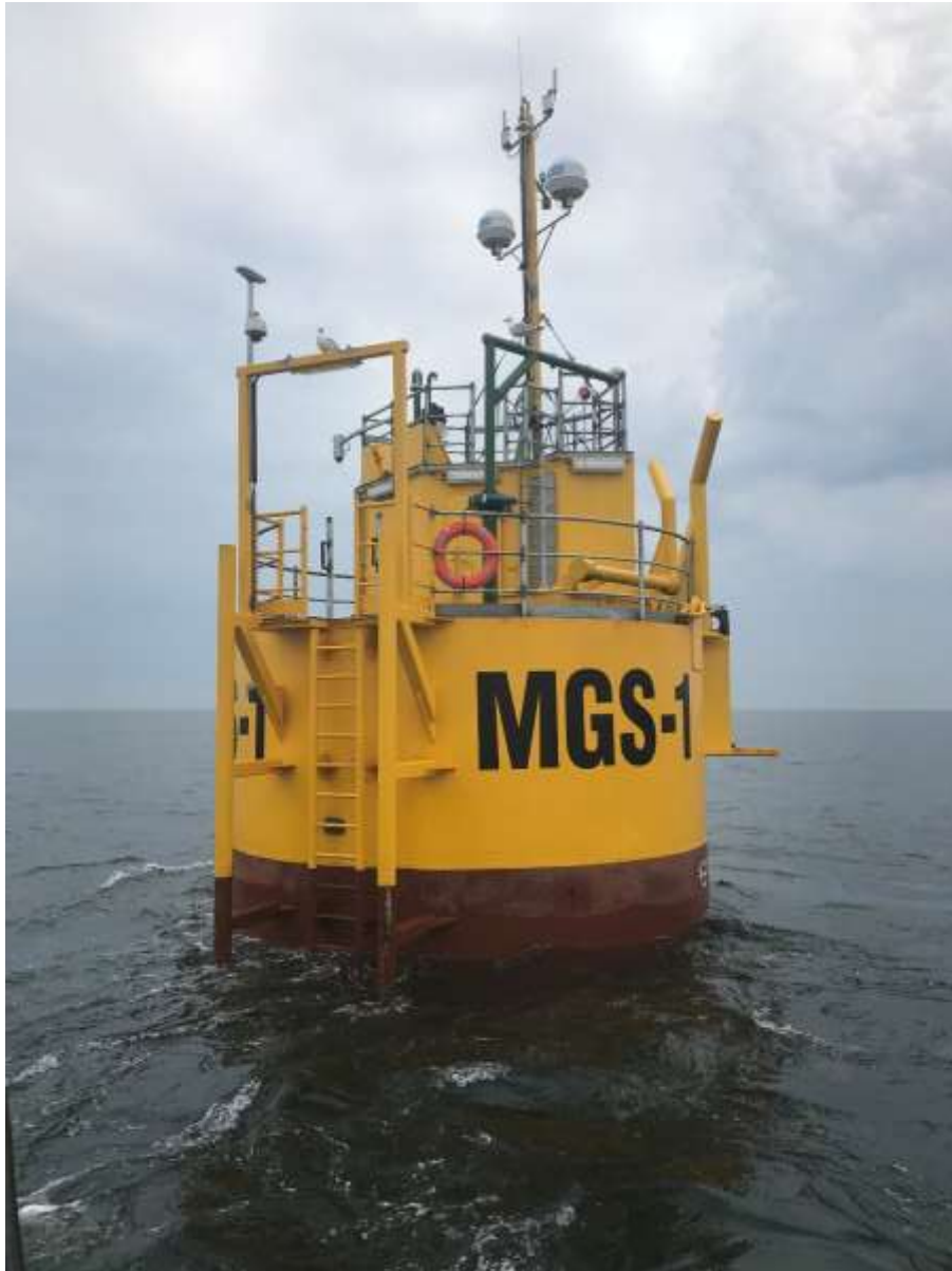
Minesto MGS 1 buoy