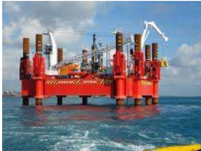
Jack up barge "WAVE WALKER"