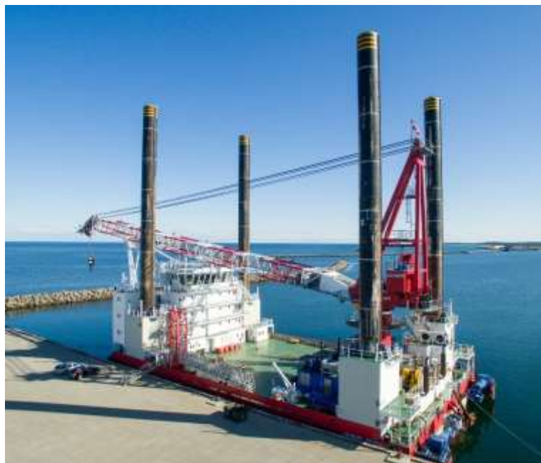
Jack up barge "WIND"