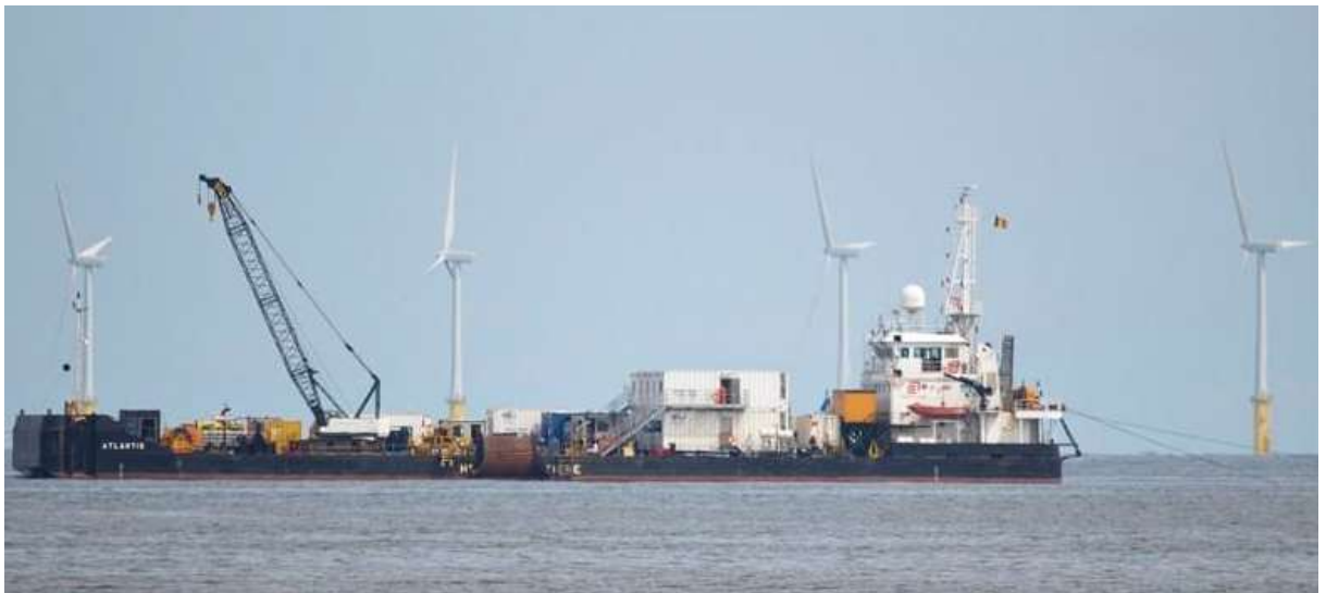
DP Shallow Water Vessel “ATLANTIS”

Vessels are requested to pass at a safe speed and distance and fishing vessels are advised to remain a safe distance (approximately 1.5 nautical miles) from the areas identified in Table 1.