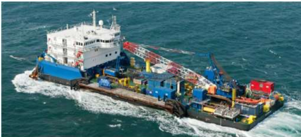
Multipurpose barge "NP289"