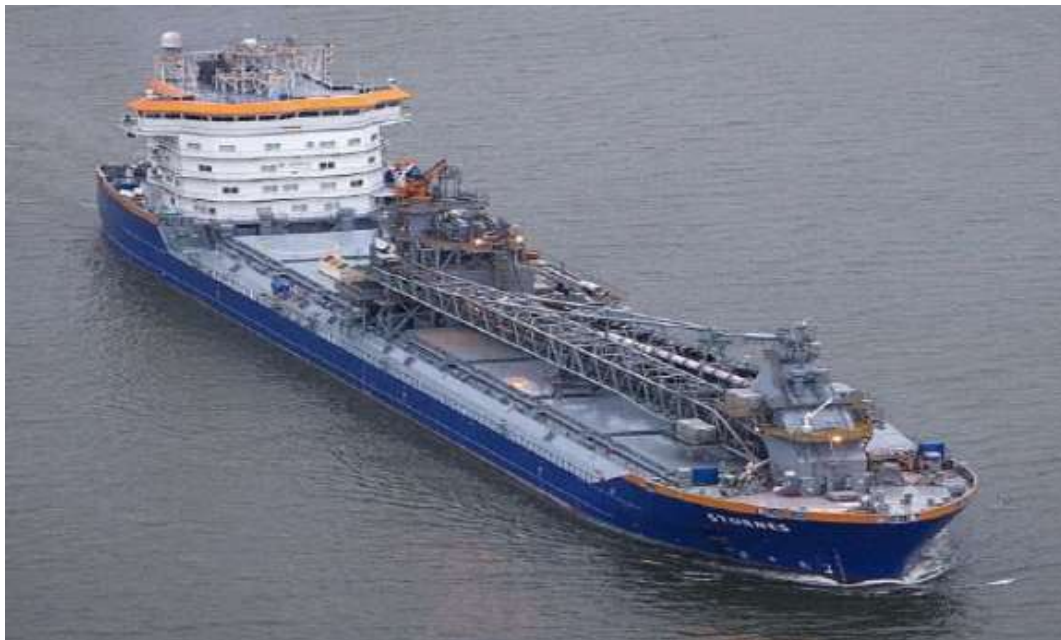
Rock Placement vessel - Stornes

The vessels will monitor VHF Channel 16 at all times.