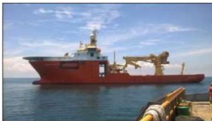
PLIB Support vessel - Normand Pacific

The vessels will monitor VHF Channel 16 at all times.