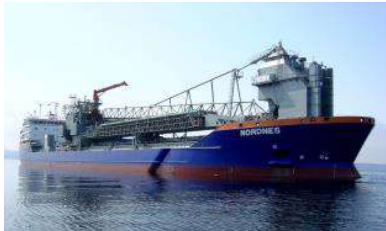
Rock Placement vessel - Nordnes

The vessels will monitor VHF Channel 16 at all times.