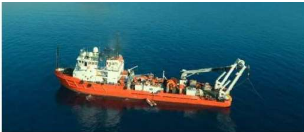
MPSV Argo I

The vessel will monitor VHF Channel 16 at all times.