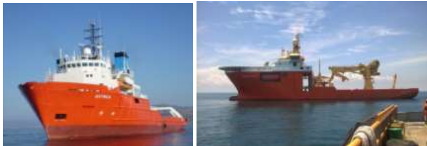
PLIB Support vessel - Astrea & Normand Pacific