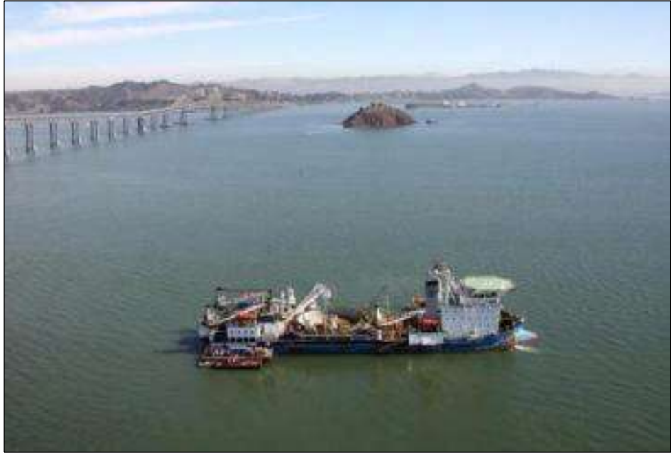
Cable Laying vessel - Giulio Verne