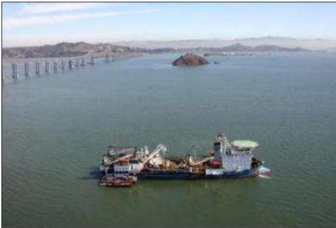
Fig 1 - Cable Laying vessel - Giulio Verne

Further details on the planned works are set out in the rest of this notice.