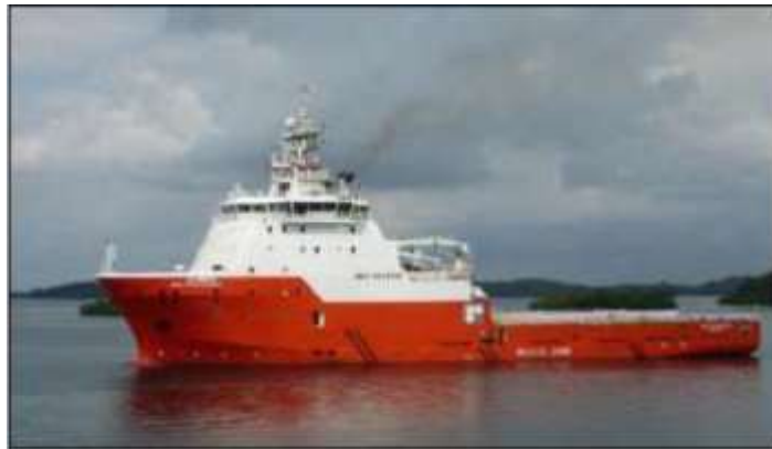
Plough Support vessel - Go Pegasus