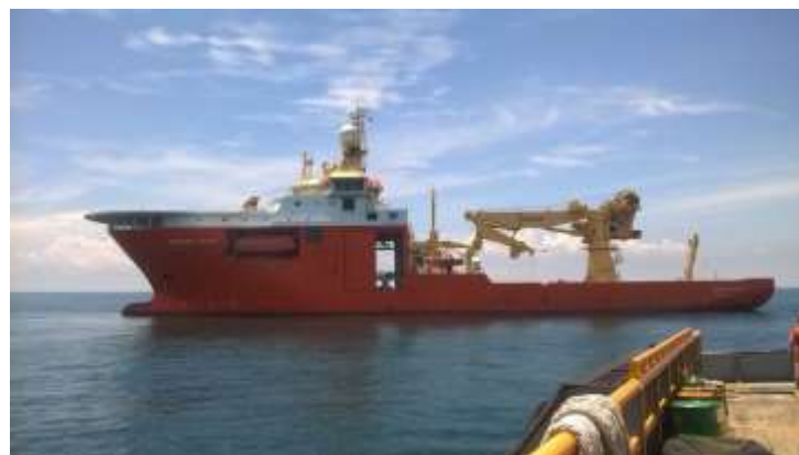
PLIB Support vessel - Normand Pacific

The vessels will monitor VHF Channel 16 at all times.