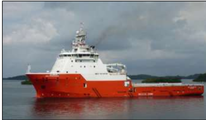
Plough Support vessel - Go Pegasus