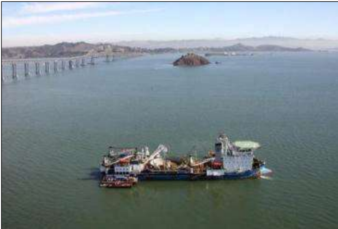
Cable Laying vessel - Giulio Verne

The vessels will monitor VHF Channel 16 at all times.