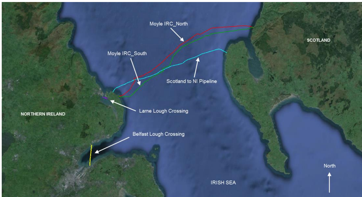
Figure 1: Overview of project areas

N-Sea plan to start operations during the week ending Sunday 10 th July 2016 from the vessels Noordhoek Pathfinder (offshore works) and SV Volans (nearshore works). Duration of Noordhoek Pathfinder work scope is expected to be approximately 3 weeks. SV Volans work scope is expected to last approximately 6 weeks.