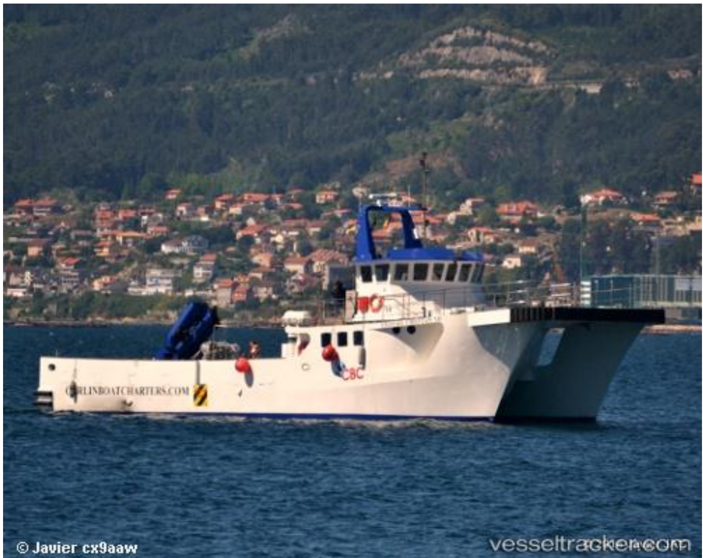
'Channel Chieftain 7'

The ' Channel Chieftain VII ' will maintain a listening watch on Digipool 1, VHF14 and VHF16 at all times.