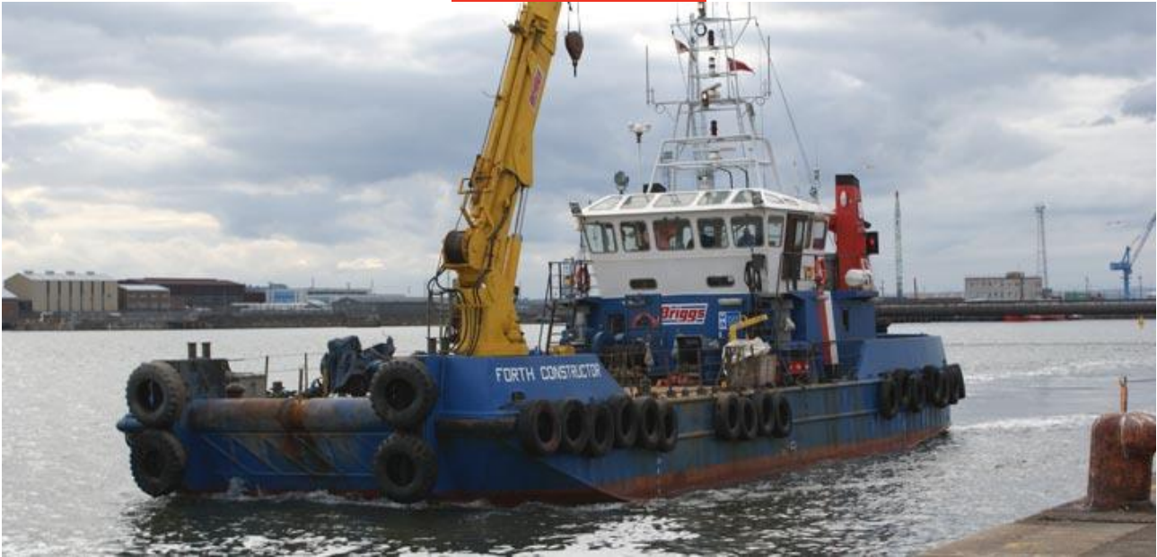
Photograph 1 – FORTH CONSTRUCTOR

Briggs Marine Divers will conduct the installation of the Mattresses from the shoreline to the 15 metre contour depth. These operations will take place day and night, commencing on or about Saturday 9 th May 2015. The vessel will be displaying appropriate shapes, lights and flags for their operations and all vessels are to maintain a safe distance and operate at reduced speed with due regard to the effects of wash.