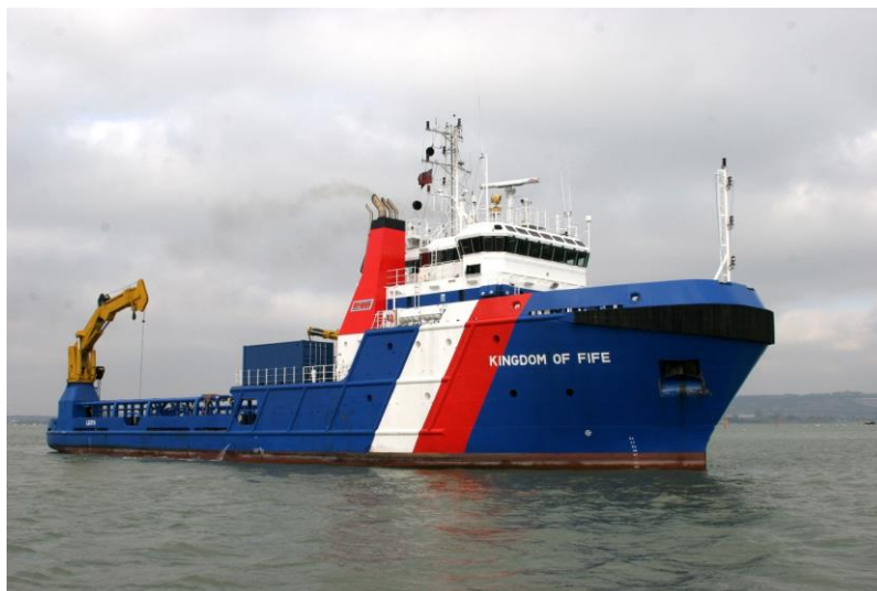
Photograph 2 – Tug KINGDOM OF FIFE

Offshore: From the 15 metre contour off Ardnail Bay to the 15 metre contour off Port a' Mhiadair, the grapnel runs will be conducted by Offshore Tug KINGDOM OF FIFE , see photograph 2, which will be towing a grapnel underwater along the seabed and will be Restricted in its Ability to Manoeuvre .