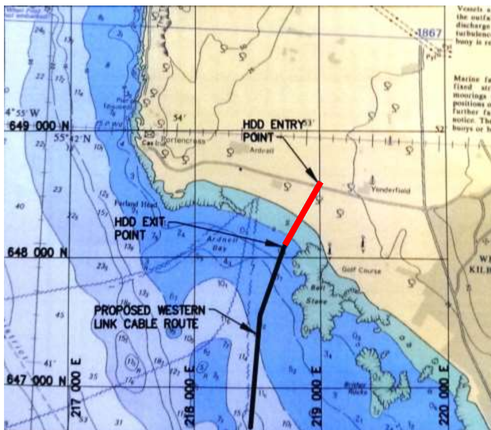
Pipes Installation location at Ardneil Bay (HDD pipes shown in Red)

Prior to the transfer of the pipes from Hunterston a work barge, the LM Constructor (MMSI 8522559, Call Sign MHUJ2), will be mobilised to Ardrossan then anchored in Ardneil Bay. The LM Constructor's tow tug is the Voe Chief (MMSI 235075142, Call Sign 2CRL5).