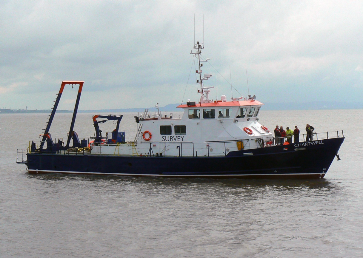
Survey vessel 'Chartwell'