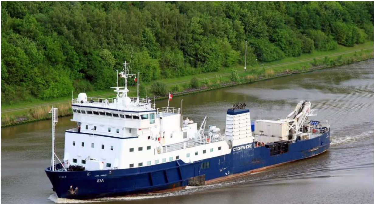
Cable laying vessel SIA