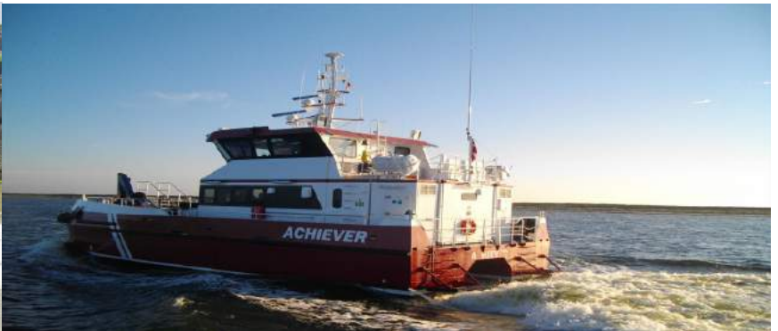
Transporter (CTV/Support vessel)