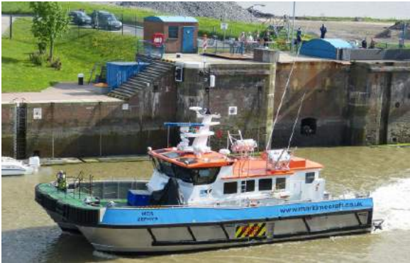
MCS Zephyr (CTV / Support vessel)