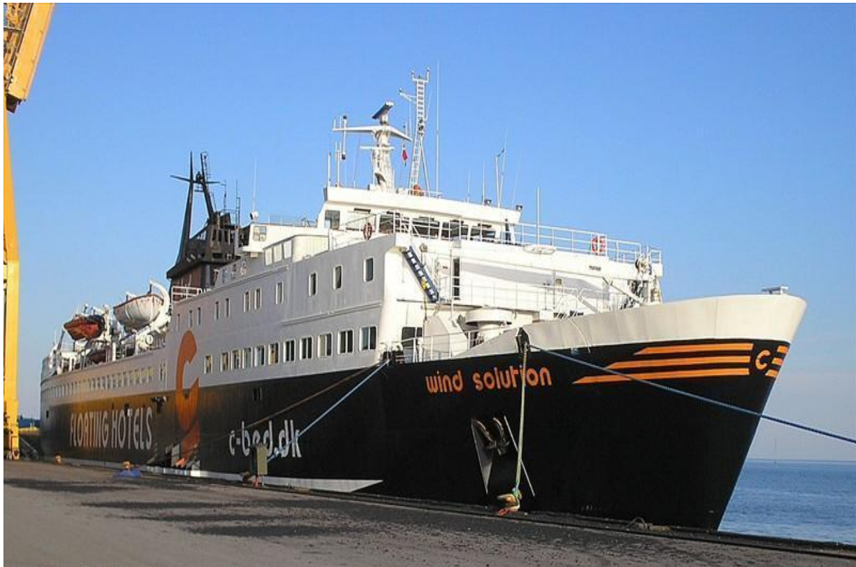
Gwynt y Mor Offshore Wind Farm