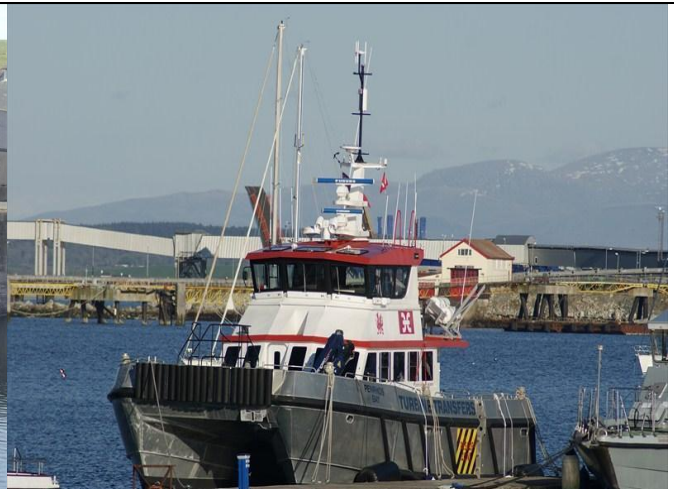
Crew transfer vessel