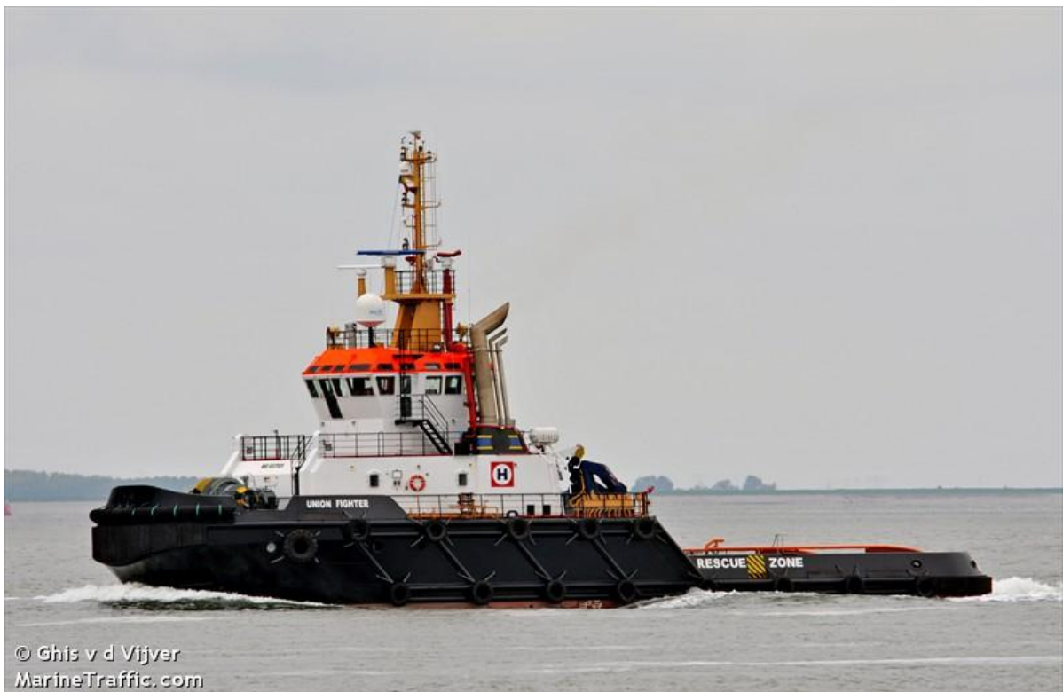
"Union Fighter" - Towage vessel for transportation barge