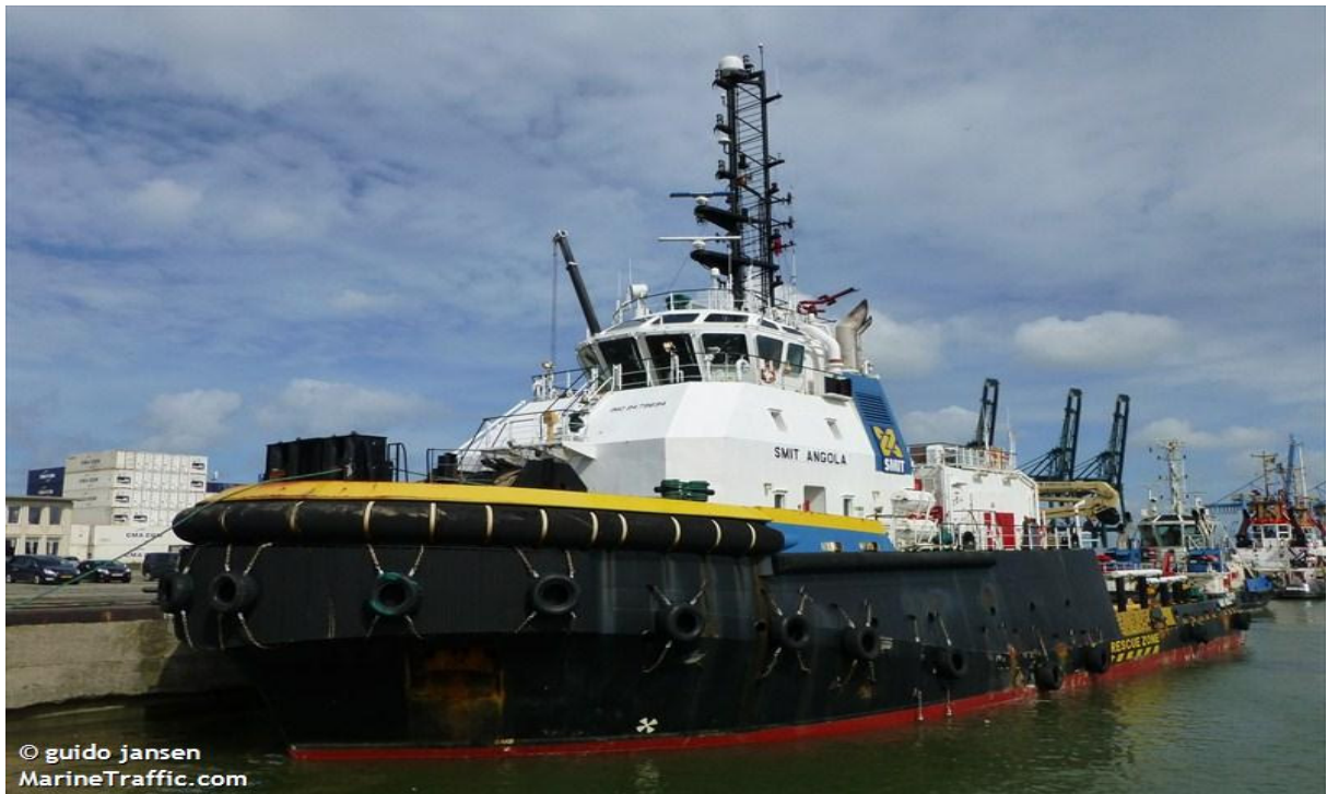
"Smit Angola" – Support Vessel for Stanislav Yudin