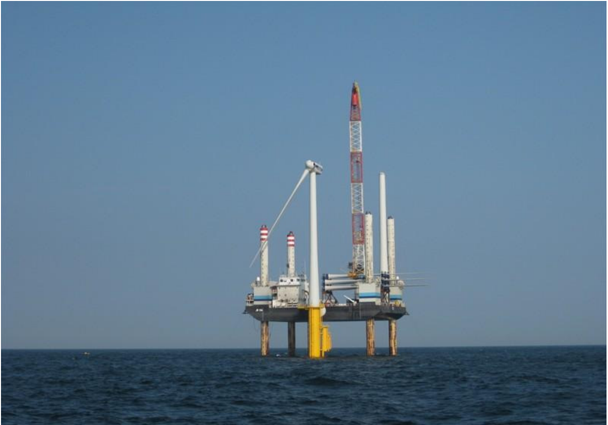
Jack up vessel "JB-114"