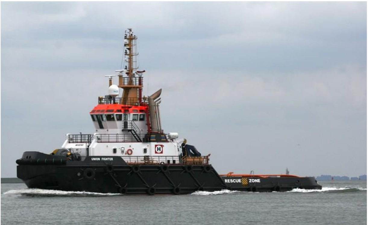
Support Tug "Union Fighter"