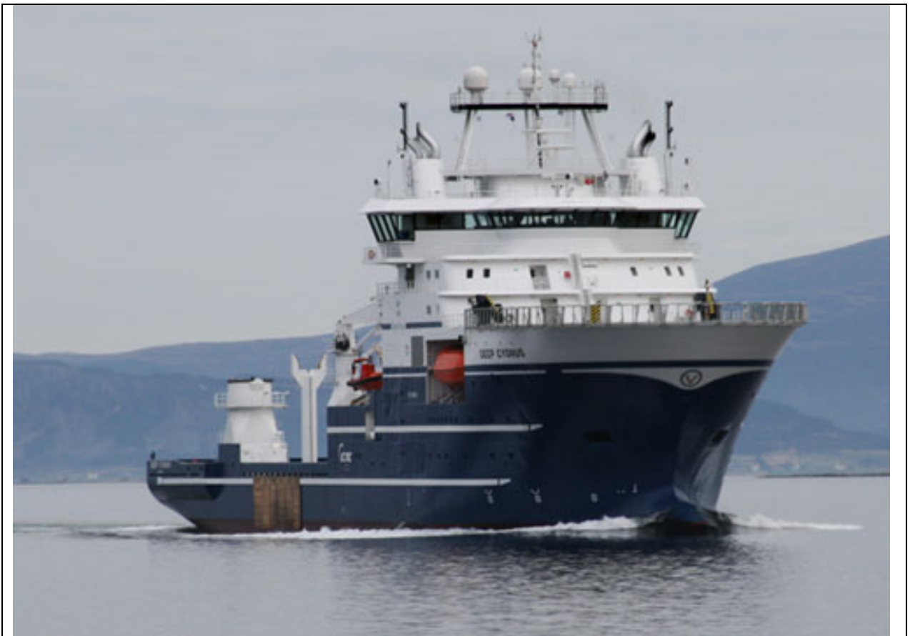
Canyon Offshore 'Deep Cygnus'

Survey operations will involve deployment of a subsea drill rig onto the seabed. During drilling operations the vessel will be unable to move and a wide berth is requested at all times.