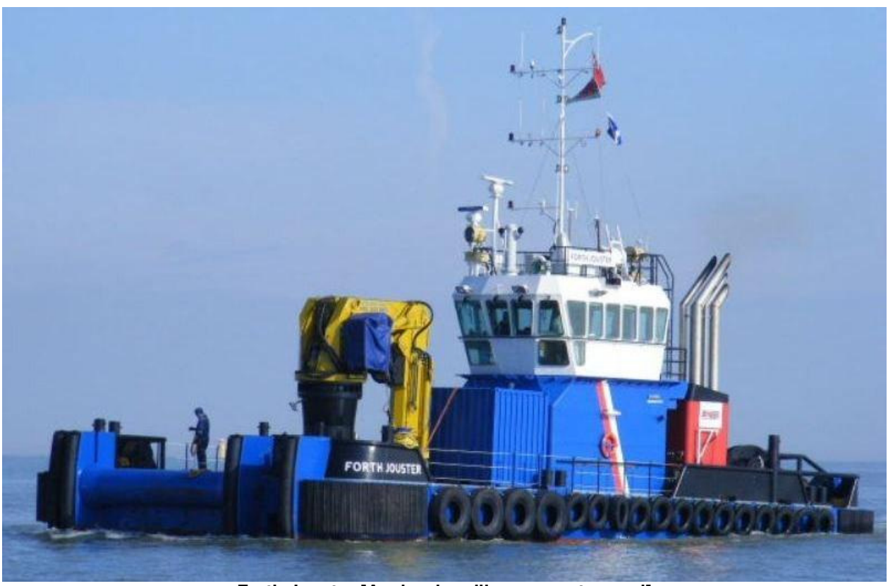
Forth Jouster [Anchor handling support vessel]

Distribution: As per GyM Notices To Mariners Distribution List. Please feel free to share the information.