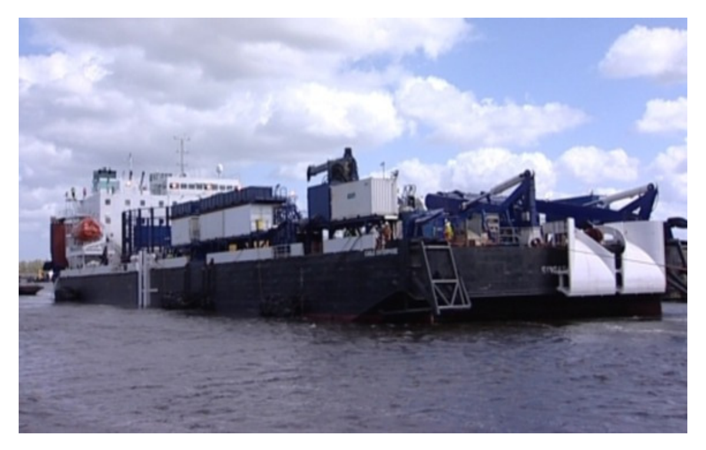
Cable Enterprise [Export Cable laying Vessel] 6 Point mooring system [Anchor cables]