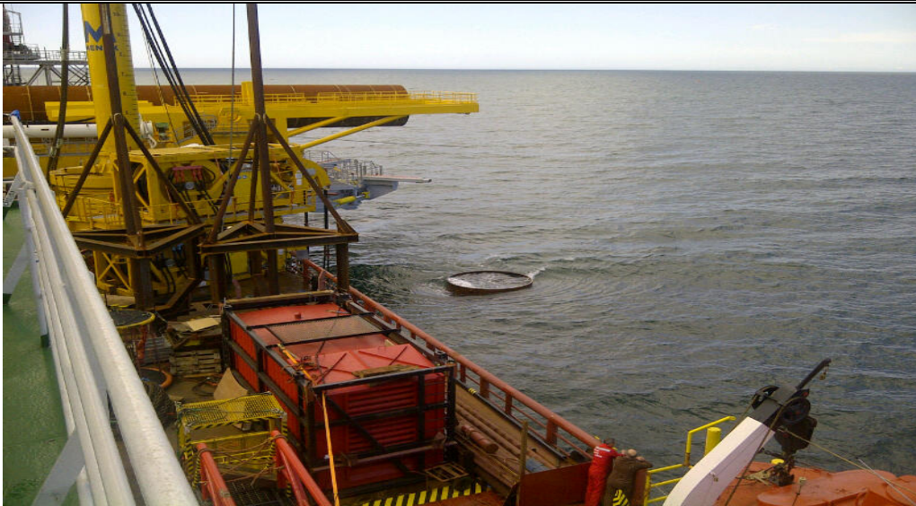
Exposed Monopile disappearing during the High Water cycle