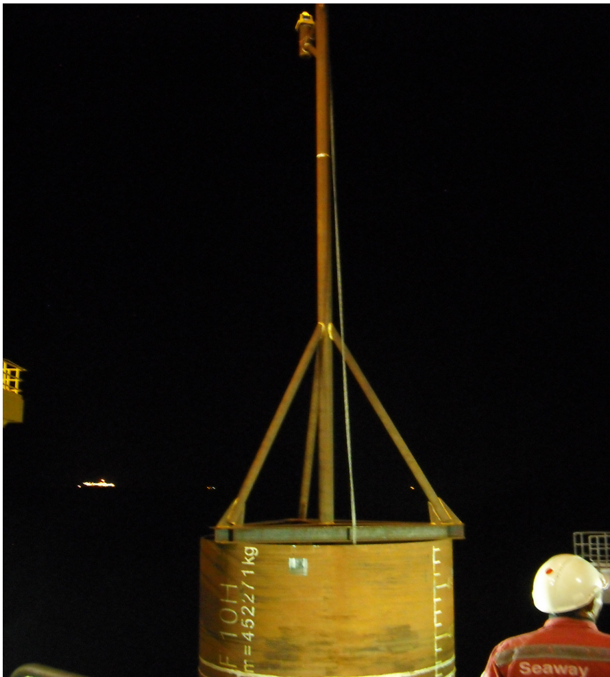
Temporary Navigation Aid at Exposed Monopiles