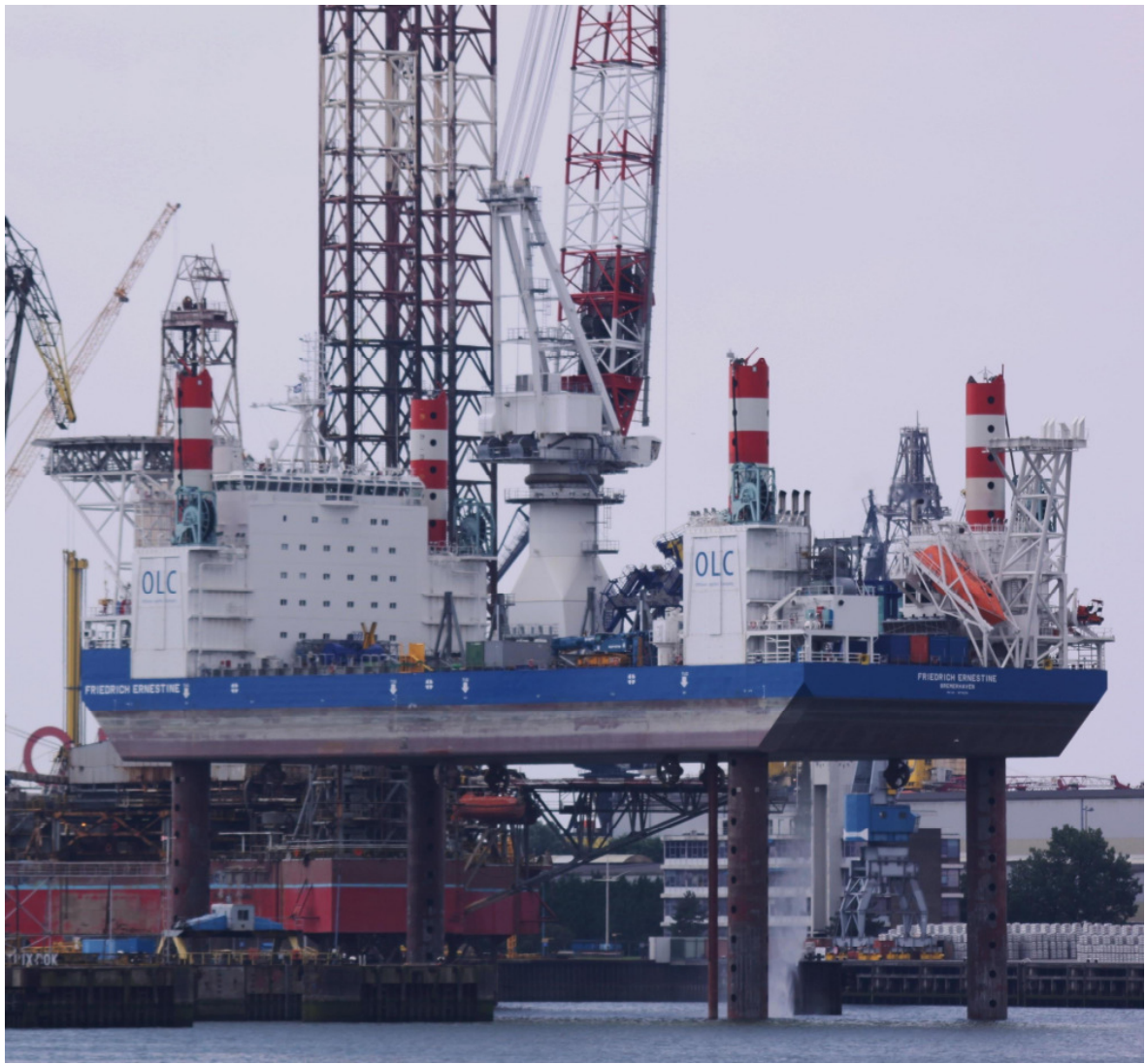
DP Jack up Vessel – Friedrich Ernestine

Distribution: As per GyM Notices To Mariners Distribution List. Please feel free to share the information.