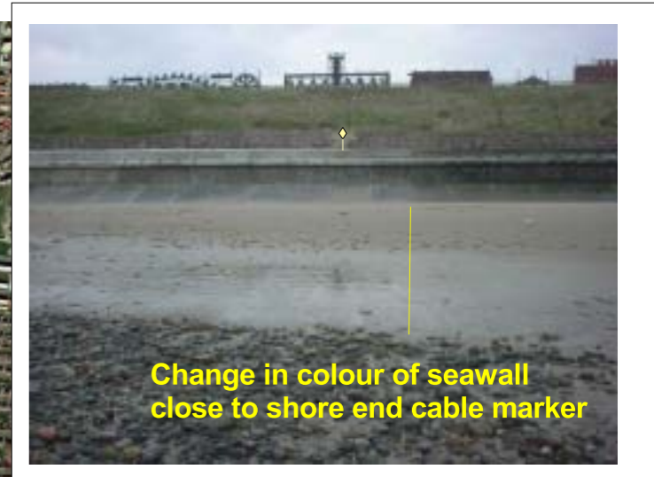
Change in colour of seawall close to shore end cable marker

Exposure extends up to 2 nautical miles (3.5 km) from shore