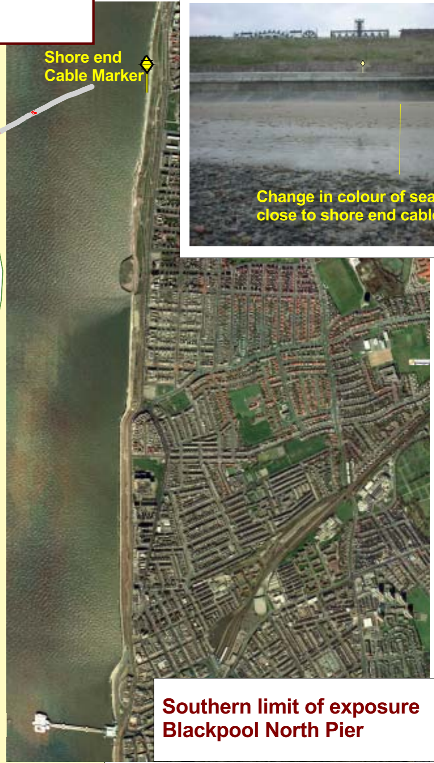
Southern limit of exposure Blackpool North Pier

The Isle of Man Electrical Interconnector is exposed on the seabed offshore at Bispham.