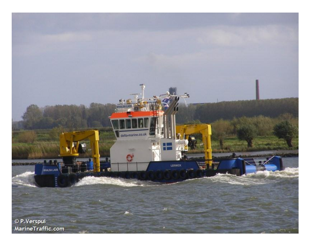
Support\ Vessel-Whalsa\ Lass