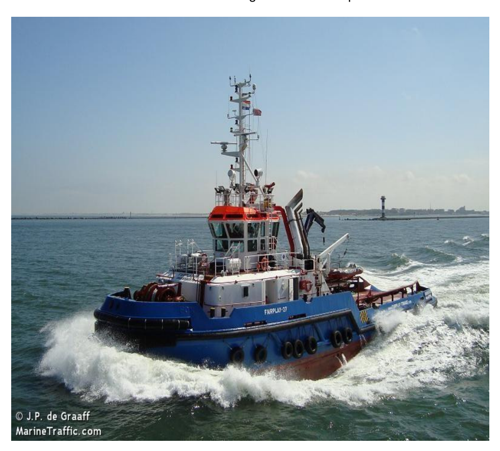
Lead Tug - Fairplay 27