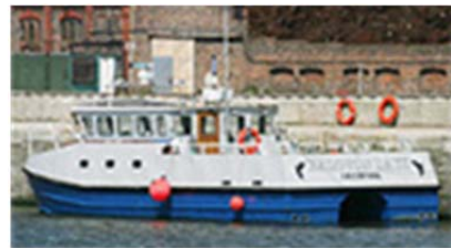
Above: Halcyon Days.

Halcyon Days is a 13m survey vessel with blue hull and white superstructure and equipped with AIS. The vessel will operate in and out of Liverpool on a daily basis, and will display appropriate day shapes or lights (including periods of reduced visibility).