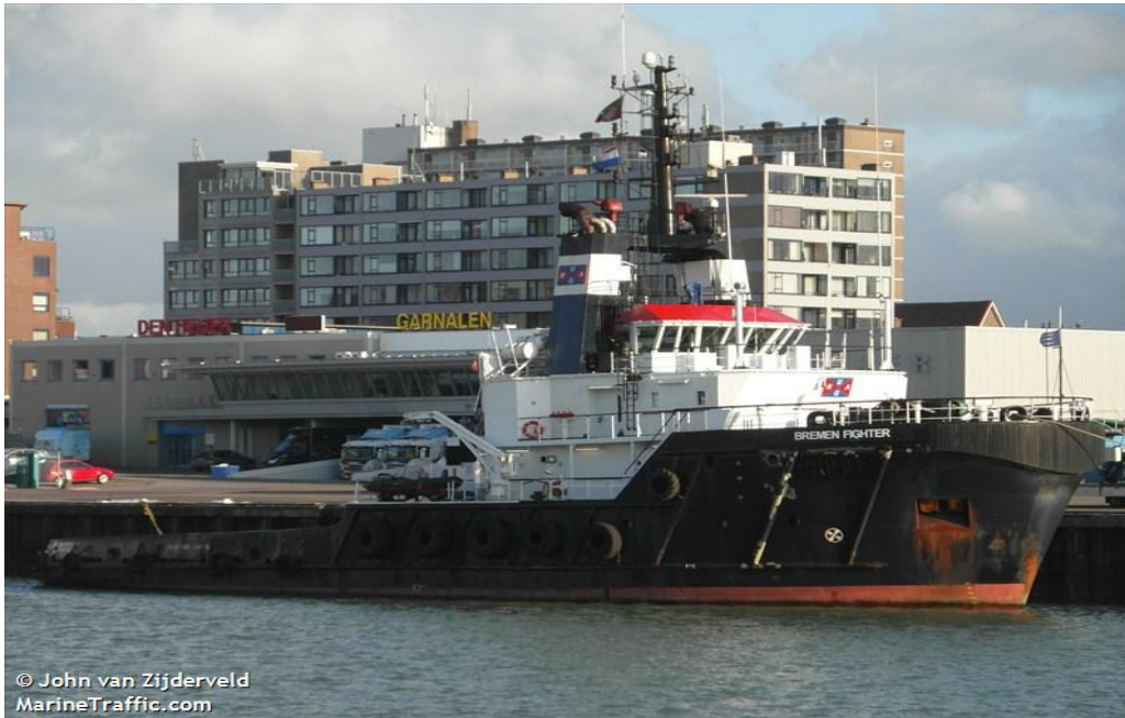
“Bremen Fighter” Towage vessel for transportation barge