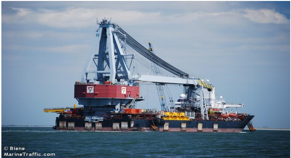
Heavy Lifting Vessel "Stanislav Yudin"