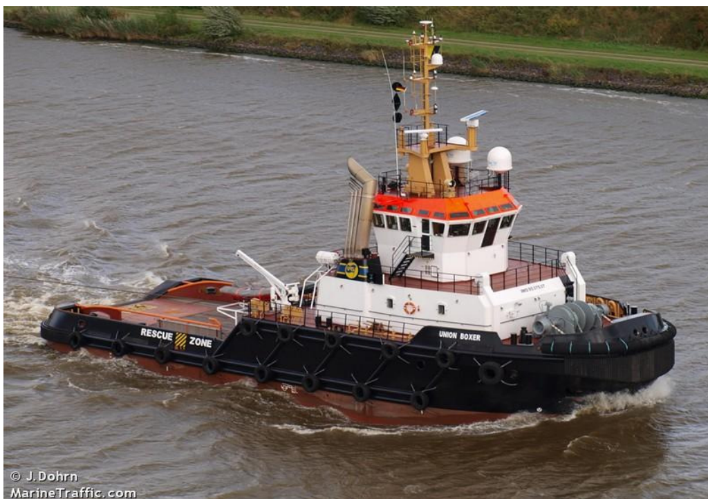
“Union Boxer” Towage vessel for transportation barge

Distribution: As per GyM Notices To Mariners Distribution List. Please feel free to share the information.