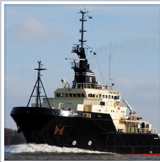
"Anglian Earl" - Support Vessel for Stanislav Yudin