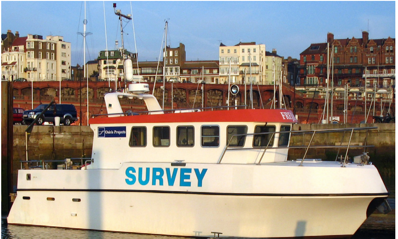
Osiris Projects Survey Vessel "Freja"

Distribution: As per GyM Notices To Mariners Distribution List. Please feel free to share the information.