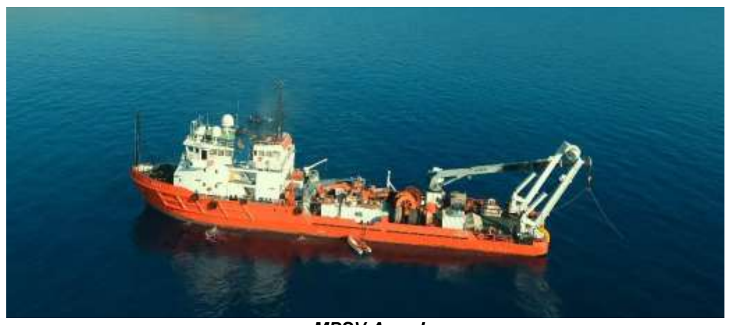
MPSV Argo I

The vessel will monitor VHF Channel 16 at all times.